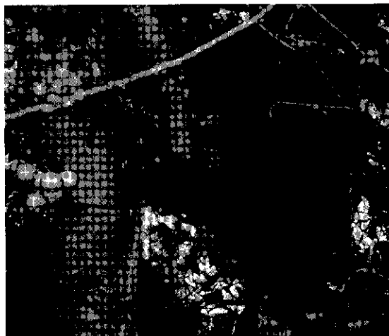
Fig. 4.1. Adolescent male chimpanzee eats figs at Mahale.

By contrast, there were only 1.2 months per year with none of the figs fruiting and only 0.7 months per year with none of the seven major food species in fruit. But figs